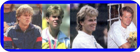
Stefan Edberg, as time goes by