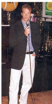
1996 in Dubai. Dashing as ever, but gaunt.