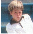
In the beginning, a mop-headed boy with rather undistinguished looks...