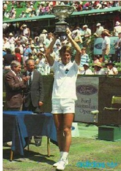
1985 Australian Open